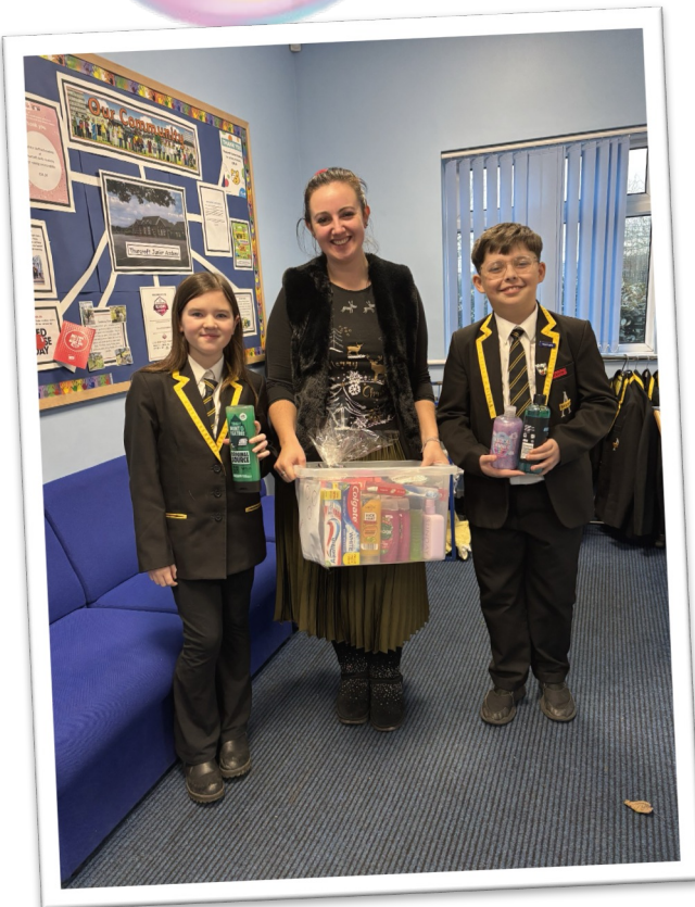
Head Boy and Deputy Head Girl presenting our donations to Rotherham NHS Trust

With your help, we supported The Rotherham NHS Foundation Trust this Christmas with their fundraising efforts.